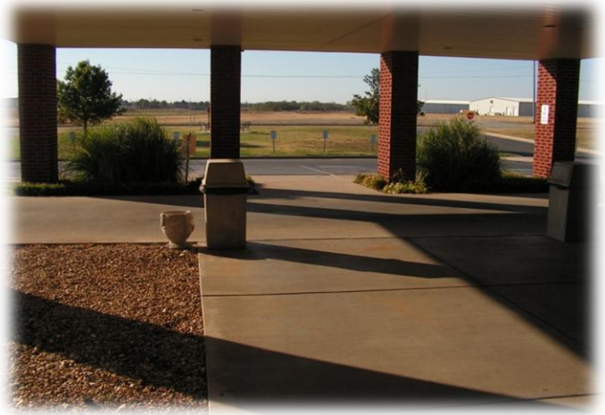
Facing Out Front Entrance Canopy